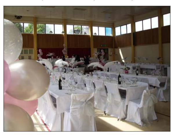
The Central Hall has a noise limiter set at 95 decibels to enable us to host events but be considerate to our neighbours.